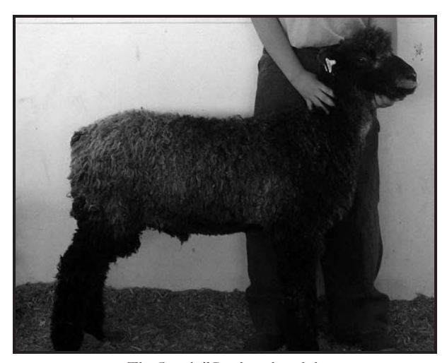
The Campbell Brothers showed the Reserve Champion Colored Ram, Campbell 549-127.