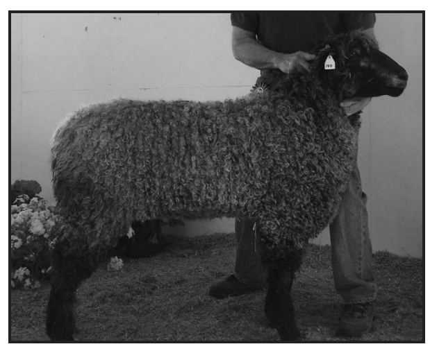
Wool Hollow 503 took Champion Colored Ewe placement for the Haddocks.