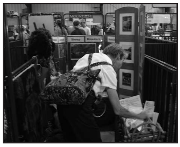
NLSBA display in the breed promotion area.