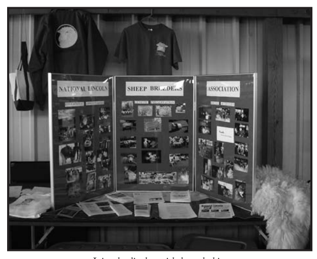
Lincoln display with logo clothing and breed information.