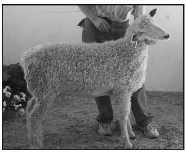
Champion White Ewe was Boersma 516 shown by Beverly Boersma.