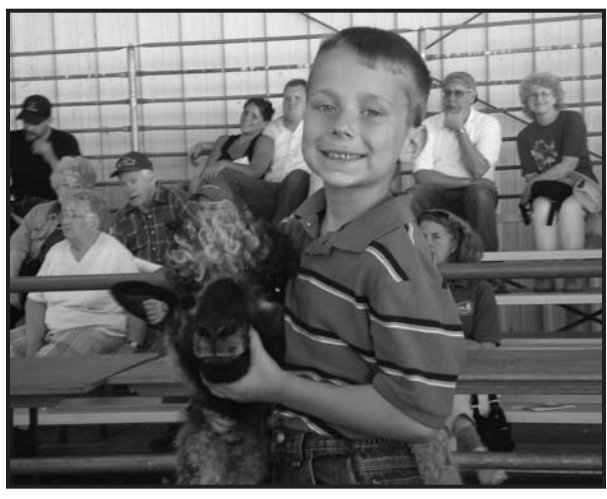
One of the Campbell Kids with a Lincoln friend enjoying the Show and Festival.